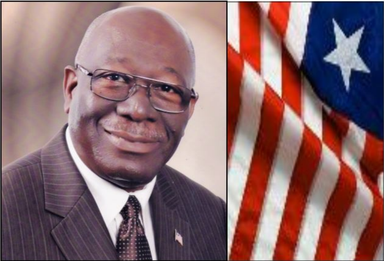
The Liberian Government Announces the Death of Hon. Alex H.N. Wallace III, Liberia's Ambassador to the Republic of Egypt.