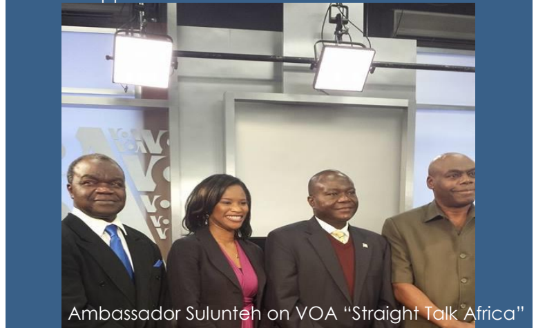
Ambassador Sulunteh on VOA "Straight Talk Africa"